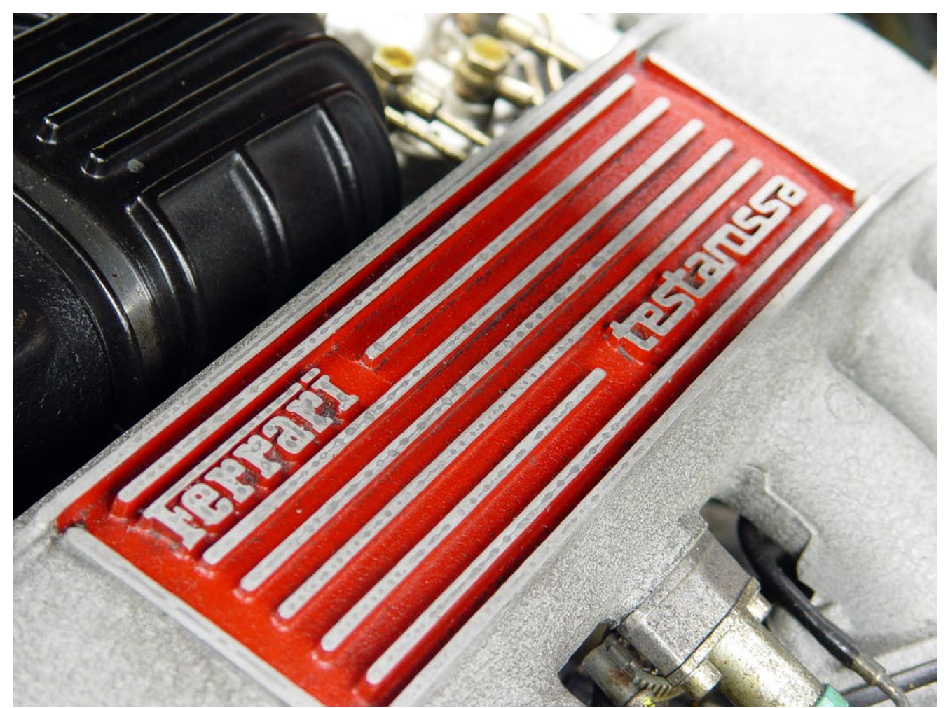
The word Testarossa literally translate into "Red Head" as Ferrari often paints the engine blocks header red as seen here on the Testarossa.